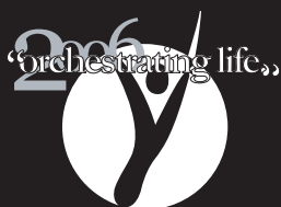
The Back of the Shirt